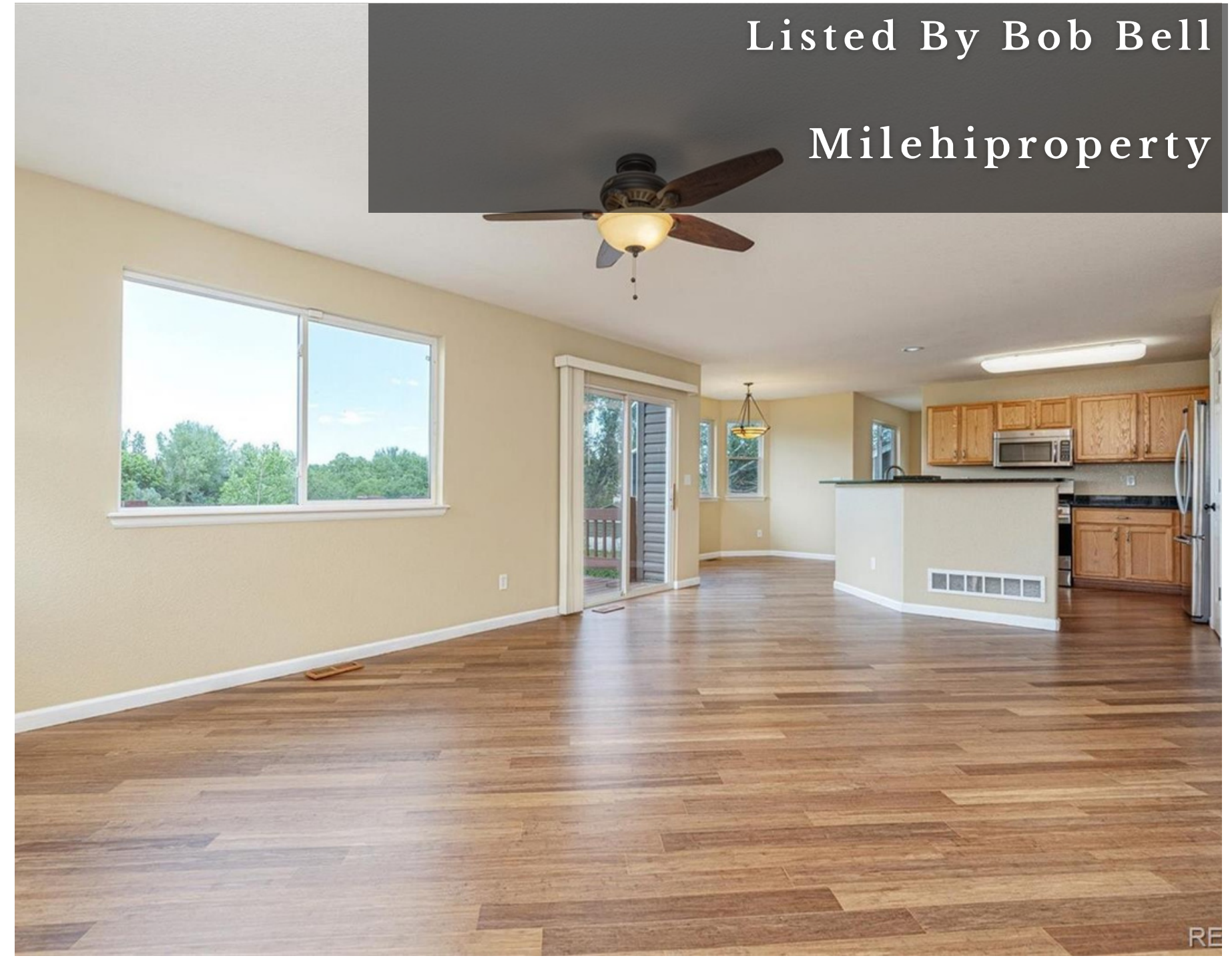
List Price: $829,900 3 Bed | 3 Bath | 3,238 SQFT